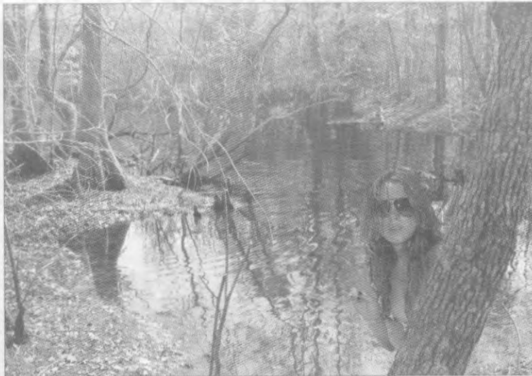
Lindsay Lohan ( Freaky Friday ) was discovered, just in time for news print, to be the bi-pedal mammal inhabiting Lake LaSalle. This is where she's been hiding so that she was able to steal crack-cocaine from students on campus.