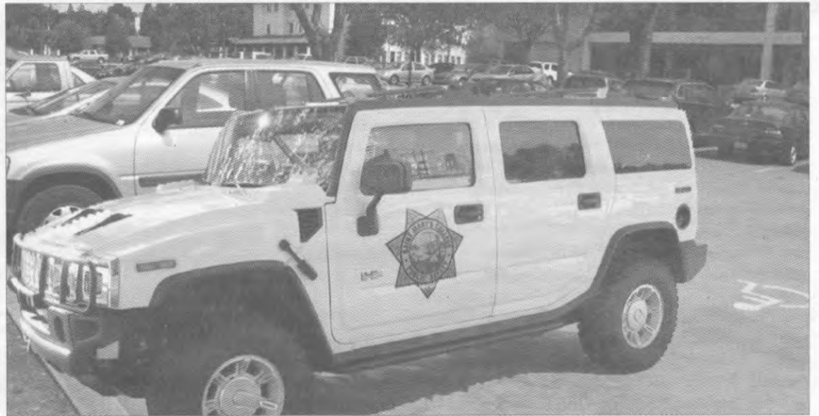
A. Doug Sneekes/COOLIGAN

Unlike previous enforcement vehicles, the H3 will allow officers to cruise in style. A smooth leather interior pads the inside of the vehicle and officers can choose to listen to satellite radio. "I admit, it's a bit more comfortable than bouncing around in a pickup truck," Foley said.