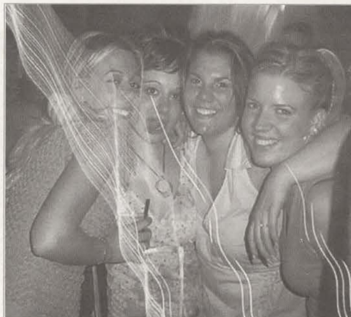
Club "Saga Nights"

"Students have been complaining about [Saga] for years. It's time we did