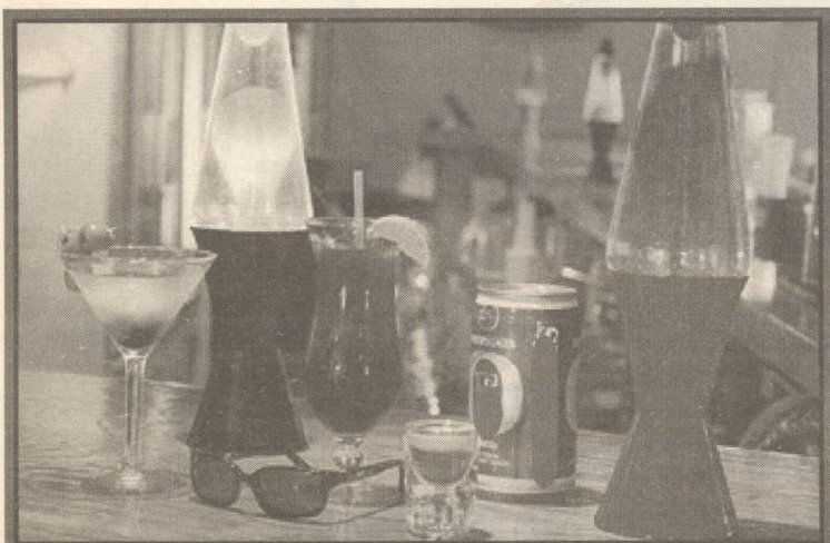
The pub will sell a number of drinks, as well as lava lamps.