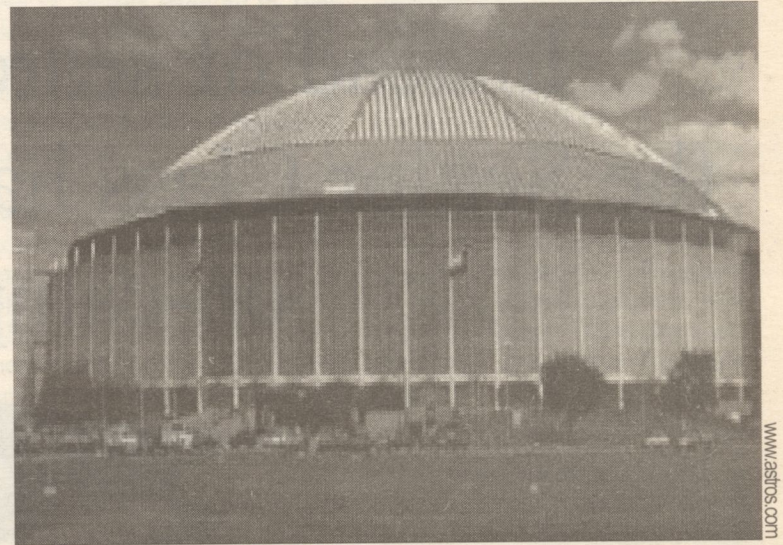
Plans for the recently opened softball field include a dome and underground parking structure.

The new dome will secure an all-weather field for the softball team, and make Cottrell Field the only state-of-the-art field of its kind in the world.