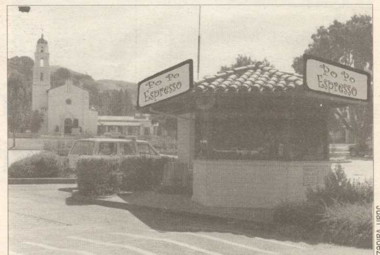
Visit with the PoPo baristas as you purchase an espresso, mocha, or latte from the new PoPo Espresso Shack.