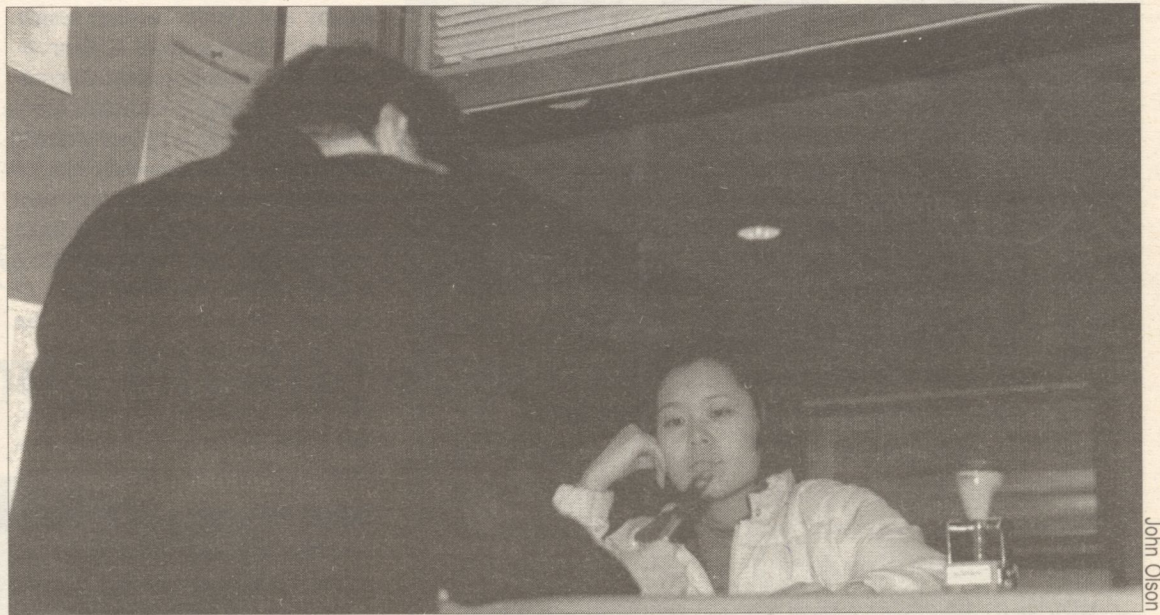
A student easily moves to the head of the line at pre-registration on Monday.

The Registrar's Office expressed concern and amazement over the effects of its decision. "We are really surprised by the low enrollment. We can't understand why eighty per-